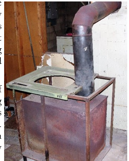
Old Wood Stove

Additionally, it was found that the attic had a decent amount of insulation, but it was severely wind washed, leaving much of the ceiling near the eaves uninsulated. Lakes and Pines' Weatherization Crew was able to install vent chutes, block the eaves and insulate the attic to R60. The generous Conservation Improvement Program (CIP) funding from the area's electric provider was also leveraged to install a new energy efficient refrigerator, clothes washer, water heater and LED lighting. The existing water heater had a failed bottom heating element, forcing the top element to work double duty, consuming significantly more energy than necessary.